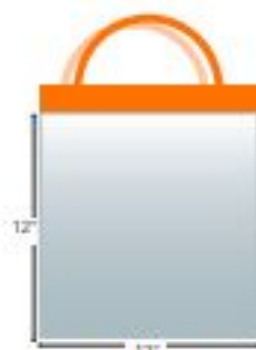
CLEAR TOTE 12"x6"x12" One bag per person