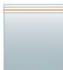
PLASTIC STORAGE BAG One gallon, re-sealable, clear One bag per person