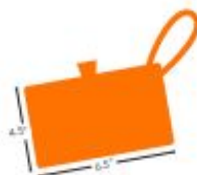
CLUTCH 4.5"x6.5" One bag per person